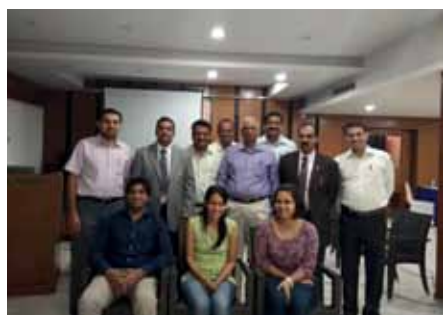
Group of participants at the PG CME of IPS held at Mysuru, India.