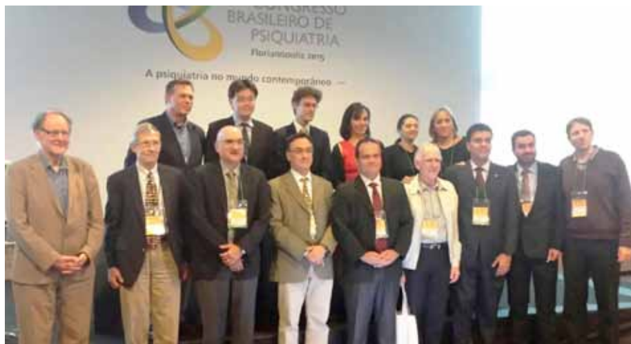
Members of the Section on Religion, Spirituality and Psychiatry at the 1st Global Meeting on Spirituality and Mental Health held in Florianopolis, Brazil from 5-6 November 2015.

The 2nd Global Meeting on Spirituality and Mental Health is planned to occur during the WPA International Congress in