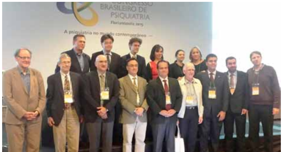
Members of the Section on Religion, Spirituality and Psychiatry at the 1st Global Meeting on Spirituality and Mental Health held in Florianopolis, Brazil from 5-6 November 2015.

The 2nd Global Meeting on Spirituality and Mental Health is planned to occur during the WPA International Congress in