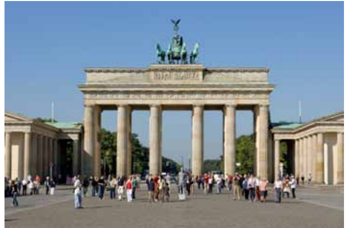
Berlin Brandenburg Gate

The theme of the WPA XVII WORLD CONGRESS "Psychiatry of the 21st Century: Context, Controversies and Commitment" is an invitation to take stock of recent developments and evidence-based findings in the field of psychiatry and their implications for diagnosis, treatment and education. Participants from all over the world can expect an outstanding scientific programme with renowned keynote speakers and excellent educational sessions, which impart state-of-the-art-knowledge. A part of the programme is especially tailored for young psychiatrists. Besides the congress is dedicated to promoting