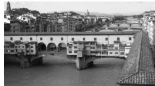
View from the Galleria degli Uffizi of the Ponte Vecchio over the River Arno, Florence, Italy.