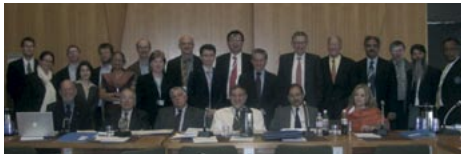
ICD-11 Mental Disorders Classification Advisory Group at its Meeting in Geneva on March 11-12, 2008.

On March 11 and 12, 2008, the high level International Advisory Group for the Revision of ICD Classification of Mental Disorders met at WHO Headquarters in Geneva. Issues of harmonization with national classifications as well as new approaches for more efficient groupings of disorders were discussed.