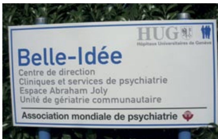
Photo of the WPA Sign recently posted outside the main entrance leading into the Geneva University Psychiatric Hospital premises.