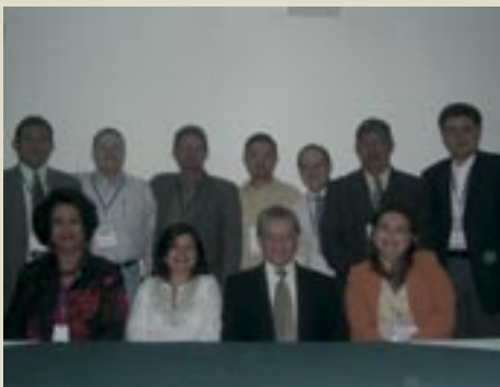
Participants at the Central American Congress of Psychiatry, March 13-15, 2008.

On March 13 to 15, 2008 the Central American Psychiatric Association met in Managua. This was the 19th annual event of this institution that encompasses six esteemed WPA Member Societies. A rich scientific and cultural program complemented opportunities for encounters of psychiatrists in Central America with colleagues from other world regions, particularly Latin America, North America and Europe.