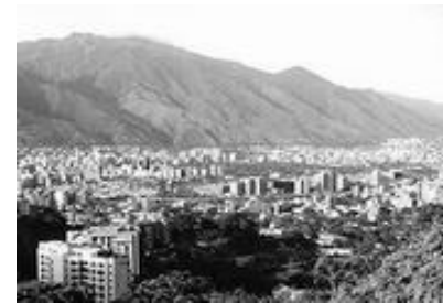
Caracas Valley, Venezuela