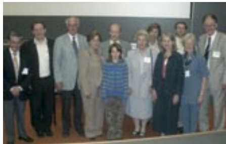
Participants in the Special session in Honor of Paul Tournier and a group of his relatives at the Geneva Conference on Person-centered Medicine, May 29-30, 2008.

The Conference was aimed at presenting and discussing the experience on person-centered principles and procedures gained under the IPPP as well as the conceptual bases of person-centered medicine, engaging interactively major international medical and health organizations, and identifying promising organizational steps for the further development of person-centered medical and health care.