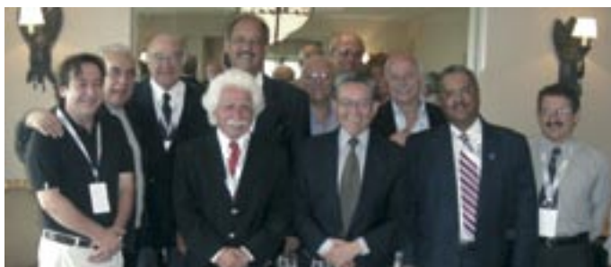
Argentinean, Latin American, and WPA leaders participating in the APSA Congress in Mar del Plata on April 18, 2008.

ric societies. One of the highlights was a well established meeting of Young Psychiatrist Fellows mainly from throughout Argentina, but also from bordering countries.