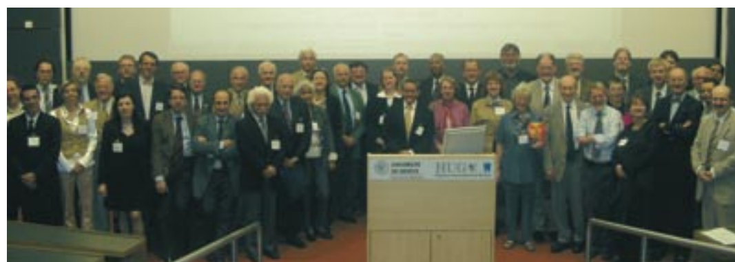
Collaborating Organizations' Leaders, Speakers and Discussants of the Geneva Conference on Person-centered Medicine organized by the WPA Institutional Program on Psychiatry for the Person in collaboration with the World Medical Association, the World Organization of Family Doctors, the World Federation of Neurology, the World Federation for Medical Education, the Council for International Organizations of Medical Sciences, the World Federation for Mental Health, the International Council of Nurses, and the International Alliance of Patients' Organizations on May 29-30, 2008.