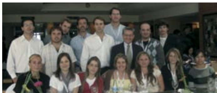
Young Psychiatrist Fellows and the WPA President at the APSA Congress in Mar del Plata, April 18, 2008.