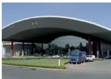
Abuja International Conference Center – African Hall

The goal of making mental health service available to those in need is a challenge for every country in the world. Increasing demand, partly based on the ageing of populations and the ever increasing demand of other social services, puts a strain on national