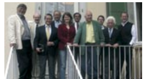
A group of participants in the Geneva Conference on Person-centered Medicine visiting the WPA Secretariat at the Geneva University Psychiatric Hospital, May 31, 2008.

During the weekend that followed some of the Conference participants visited the WPA Secretariat at the Geneva University Psychiatric Hospital. Also a workshop of the WPA Institutional Program on Psychiatry for the Person took place then and there, during which advances were made on the conceptual bases of the Program, the Person-centered Integrative Diagnosis model, Guidelines for and a Curriculum on Person-centered Clinical Care, and related public health projects.