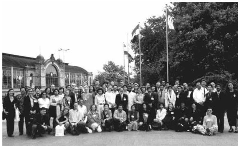
XI WCP Fellows and Fellowship Committee Members, Hamburg, 1999.

Several opportunities are being open for the pointed participation of our younger colleagues in the life of WPA, such as the Educational Liaison Networks for Young Psychiatrists and for Psychiatrists-in-Training. Great interest exists, as well, on the prospective Institutional Program for the Professional Development of Young Psychiatrists, to be built on recent WPA experiences in Central Europe.