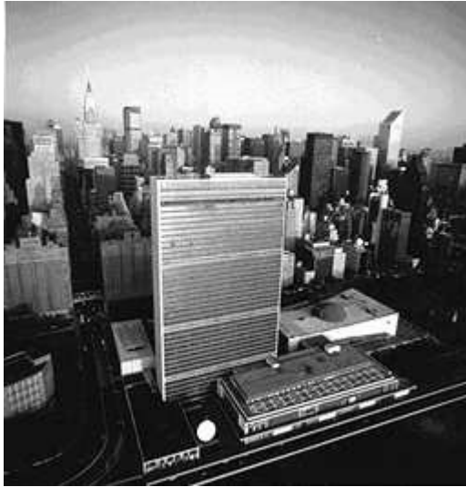
The UN, New York City