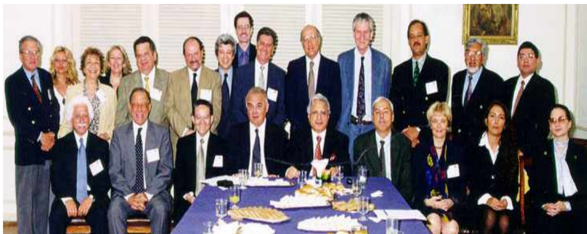
WPA Executive Committee Members, Congress Organizers, WPA Section Officers, and Latin American Member Society Leaders at the WPA Regional Meeting, Buenos Aires, October 1999