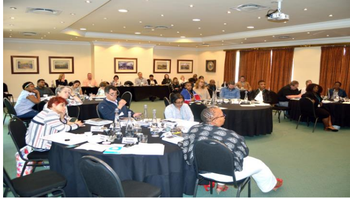
Figure 1: SASOP ECPs and their lecturers at the Registrar Finishing school. Johannesburg; November 2017

Future activities of the ECPs include planning symposia and social events at the next SASOP congress in September 2018. Beyond our borders, the section is actively pursuing forming a bond with all ECP formations across Africa. We are working closely with other neighbouring countries, collaborating with them in growing and developing both academic excellence and patient care in the region.